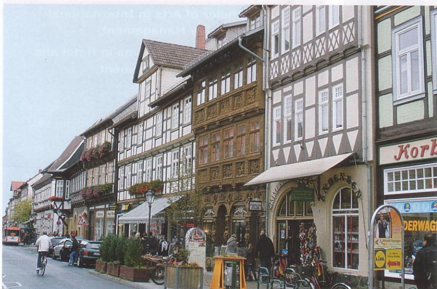
Wernigerode, another gem of a town