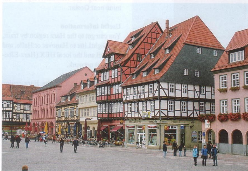
A mediaeval atmosphere in the centre of Quedlinburg

Do you know where the Harz mountains are? Yes, that's right, they're on the edge of what was formerly East Germany, facing west, and lying south of Hanover, Brunswick and Magdeburg. The highest point is the Brocken at 1141m, which you can still reach by a steam railway built in 1898. At the top there used to stand the most important military listening post for spies from the west, which was operated by the USSR and the GDR and closed off to the public. This came to an end in 1991, and the railway line was re-opened. Now everyone has access to the Brocken with its beautiful panoramic views, and only the museum that's there now reminds you of days gone by.